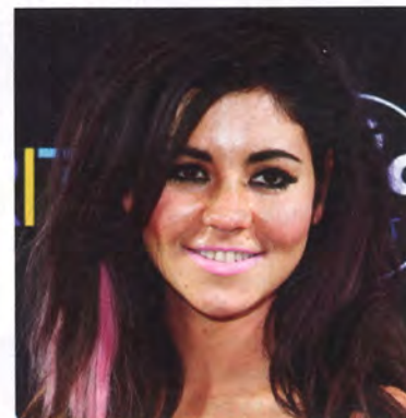
MARINA DIAMANDIS Matchy-matchy cheeks, lips and hair