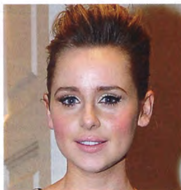
DIANA VICKERS Wicked heart, rosy complexion