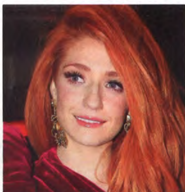
NICOLA ROBERTS Pale skin: allowed