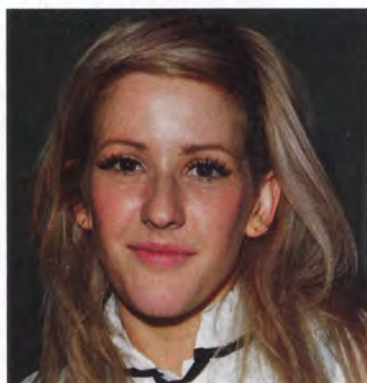
ELLIE GOULDING Bright lights, natural glow