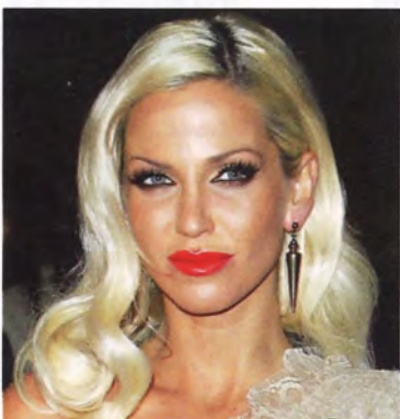
SARAH HARDING Old-skool hair, new-skool tan